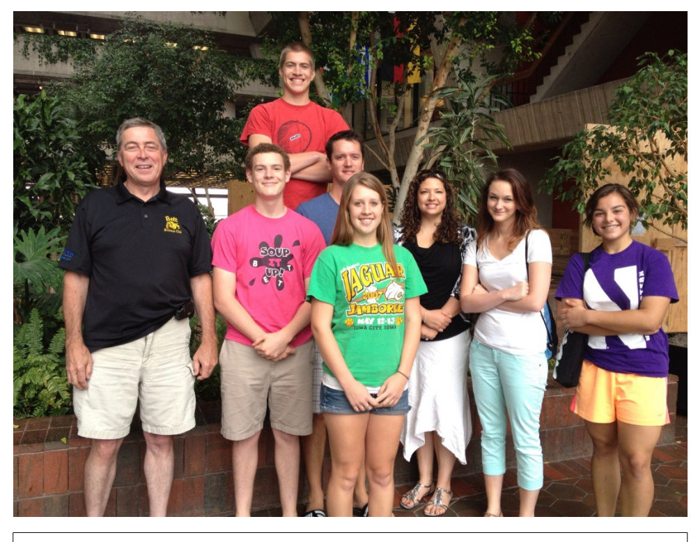
2012 Research Students and Teachers

The students were engaged in many projects but first we had to take down a lab in one room and set up a lab in another. This involved preparing the room for our research using a soldering station, data acquisition racks, crates and cards along with the associated wires and instruments such as oscilloscopes and power supplies. We also had to prepare the computers for these activities by reformatting them and adding software that would do what we needed.